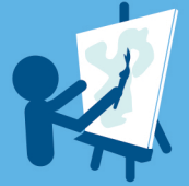
ILLUSTRATION • FINE ART utilized for special projects

EDUCATION CLIENT'S BRAND CONSISTENCY DIRECTION